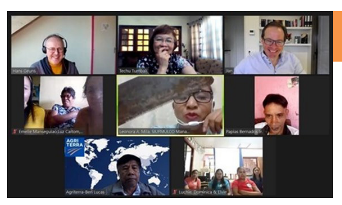
Online cooperative assessment

Agripoolers will continue to play an important role in Agriterra's Farmer Focused Transformation approach to achieve its vision of making professional agricultural cooperatives truly an engine of economic progress.